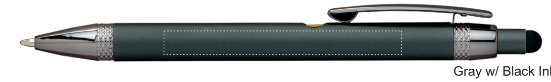
Gray w/ Black Ink