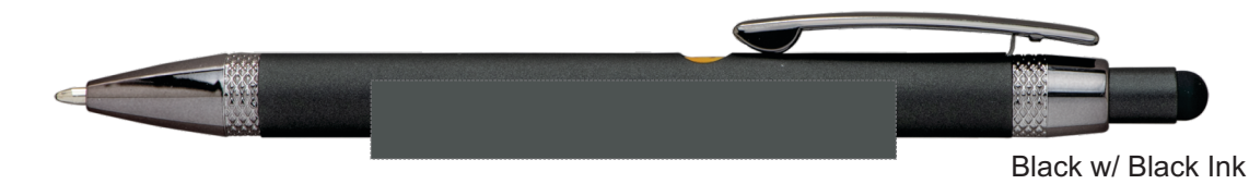
Black w/ Black Ink