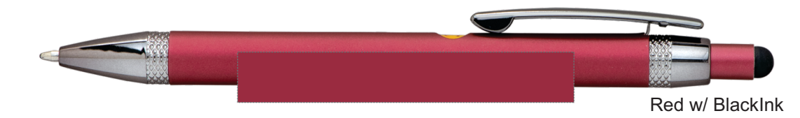
Red w/ Black Ink