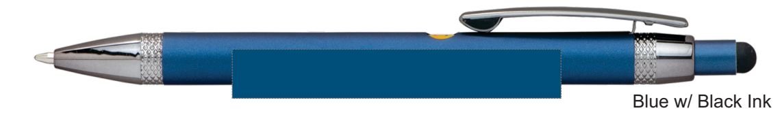
Blue w/ Black Ink