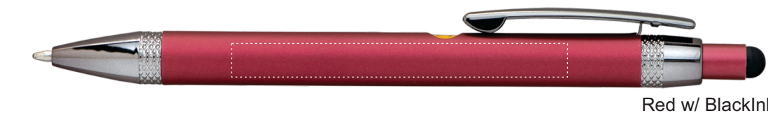
Red w/ Black Ink