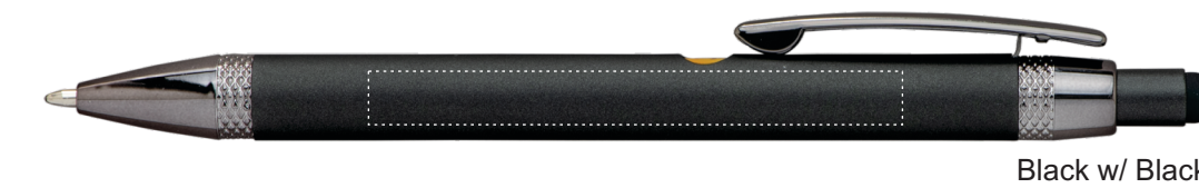
Black w/ Black Ink